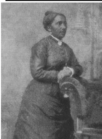
ELIZABETH JENNINGS GRAHAM March 1827 - June 5, 1901

Elizabeth Jennings Graham was an African American teacher and civil rights figure. In 1854, Graham insisted on her right to ride on an available New York