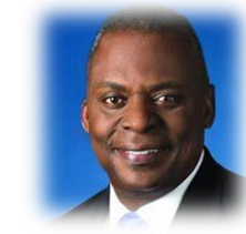
First Black Secretary of Defense of US