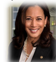
First Black/Indian Woman Vice President of US