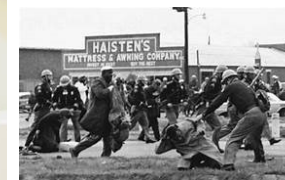
The Struggles of African Americans