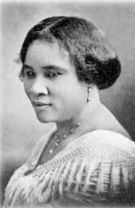
Madame C.J. Walker