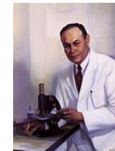
Dr. Charles R. Drew