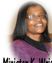
Minister K. Wright