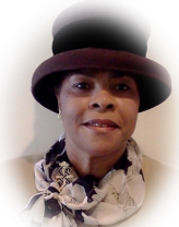
Minister P. Tolbert