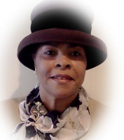
Minister P. Tolbert