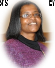
Minister K. Wright