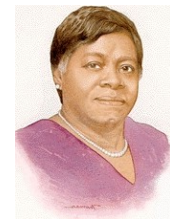
Mary McLeod Bethune